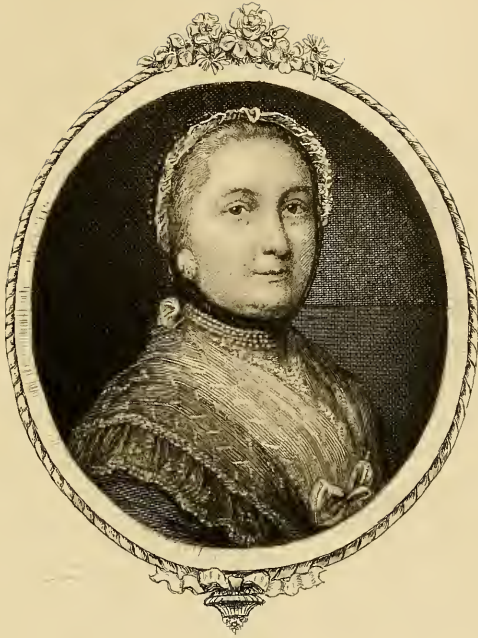
Mme. de Maintenon